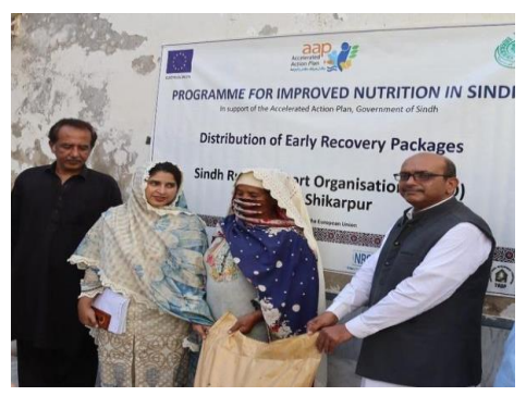
maunds more than average).

To mitigate the disastrous impacts of floods in Sindh, the EU announced Early Recovery packages to support small scale subsistence farmers to cultivate bio-fortified wheat to address micro-nutrient deficiencies. In collaboration with RSPN, on November 20 & 21, 2022 SRSO distributed seeds of bio-fortified wheat to 305 female farmers under the Program for Improved Nutrition in Sindh (ER-III).