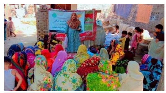
women in the affected area.